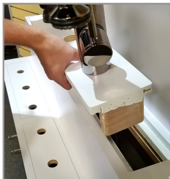
SHELF INSERTS CAN BE REMOVED FOR EASY FAUCET MOUNTING